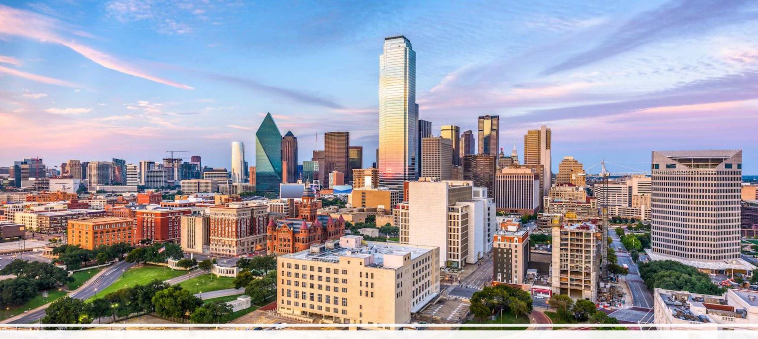
See y'all in Dallas in 2023!